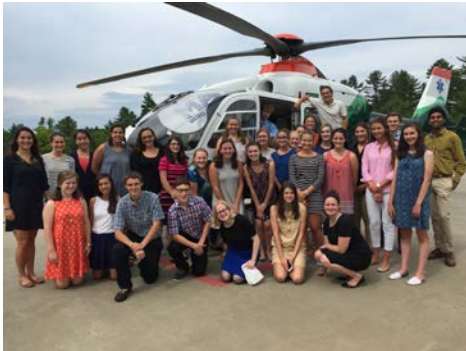
Students learn from the DHART Team!